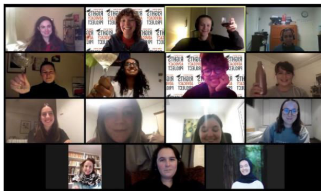
RAP Steering Committee, volunteers and supervisors at a virtual celebration event in June 2020